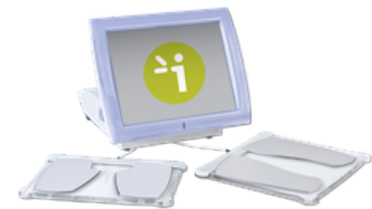
Impeto Medical's SUDOSCAN Device

Impeto's U.S. patents are 8,655,443 (issued February 18, 2014); 8,918,170 (issued December 23, 2014); and 8,934,954 (issued January 13, 2015). The SUDOSCAN® trademark is the subject of U.S. Registration No. 4,181,325 (issued July 31, 2012).